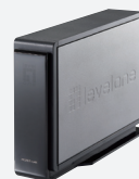
GNS-1001 1-Bay Gigabit Network Storage